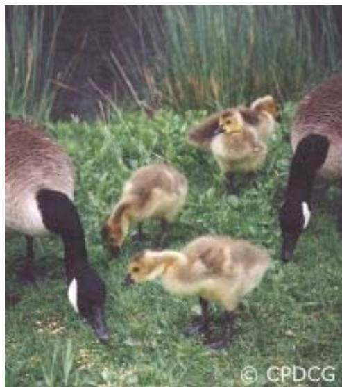
Coalition for the Prevention of the Destruction of Canada Geese

The first Canada goose brood was observed the last week of April which is a little later than average. Over the next several weeks several broods were sighted indicating a respectable hatch this year.