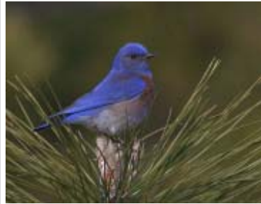
Western Bluebird courtesy of Ron Dexter

A spotted towhee was observed on 3/3/2007. Western bluebirds were first seen on 3/6/2007. This is about a week later than normal. Northern pintail and American wigeon came through rather quickly that first week of March, too.